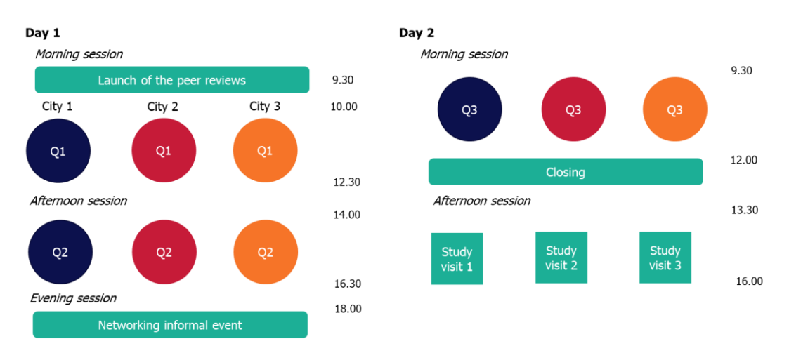
Indicative agenda for a peer review event

Each breakout session at the event will be composed of i) up to four representatives from the city under review, ii) up to four peers iii) two experts, trained in the Peer Review methodology and in charge of drafting the report.